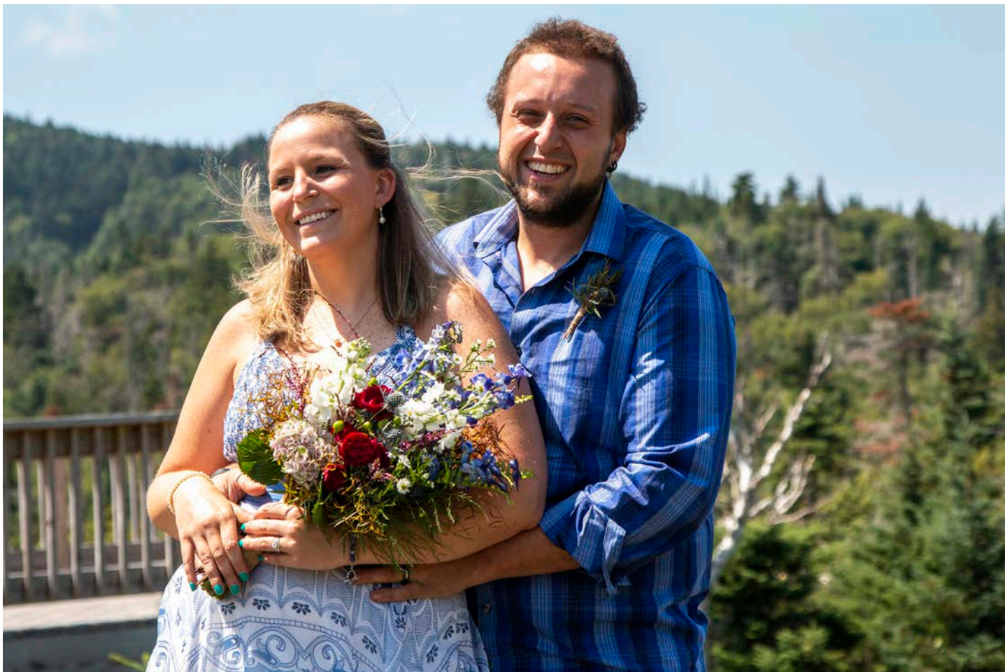
Summer Elopement Ceremony