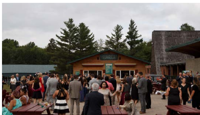
Receptions on the Lawn and Patio