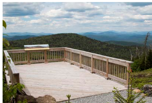
The Fairview Deck