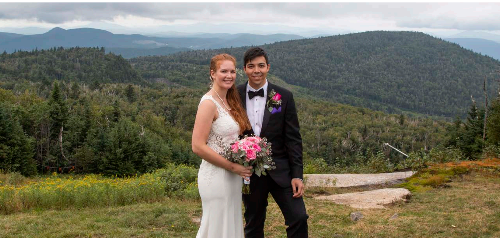
Couple Posing on top of Bear Mountain

Our wedding packages include taxes, service charges, and reception room rentals. Fees for an on-site ceremony, rehearsal dinner, or post-wedding breakfast are additional. Event insurance is required, but is not included in our wedding packages. We offer our own TULIP insurance with pricing based on head-count, or you can insure through your choice of insurance.