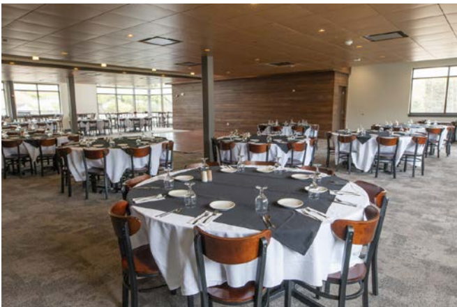
Indoor Round Top Seating

Sit and soak up the warmth at the end of a festive evening.