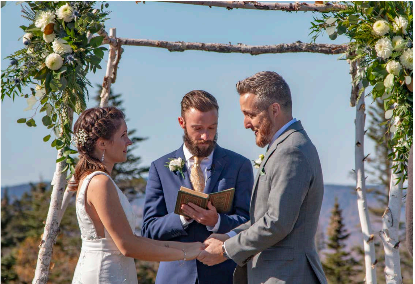
Fall Bear Mountain Ceremony