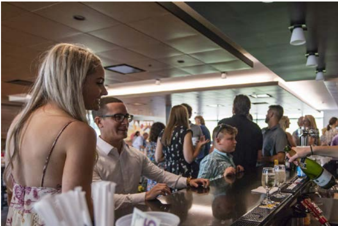
Reception in The Tannery Banquet Hall