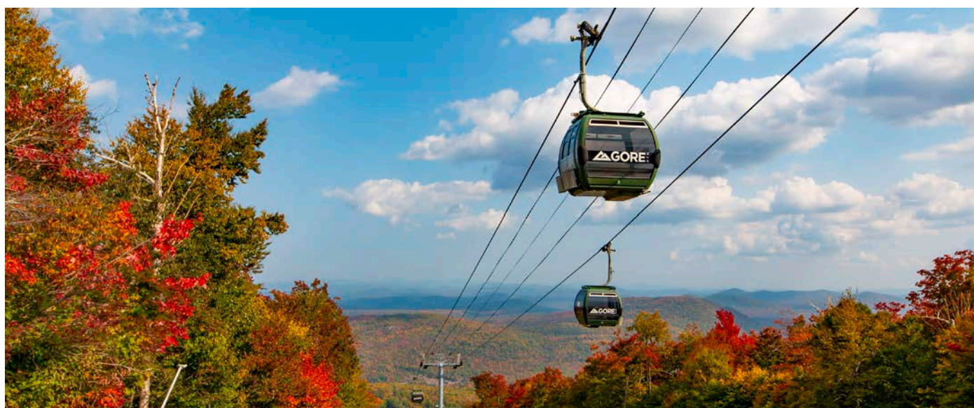
The Northwoods Gondola