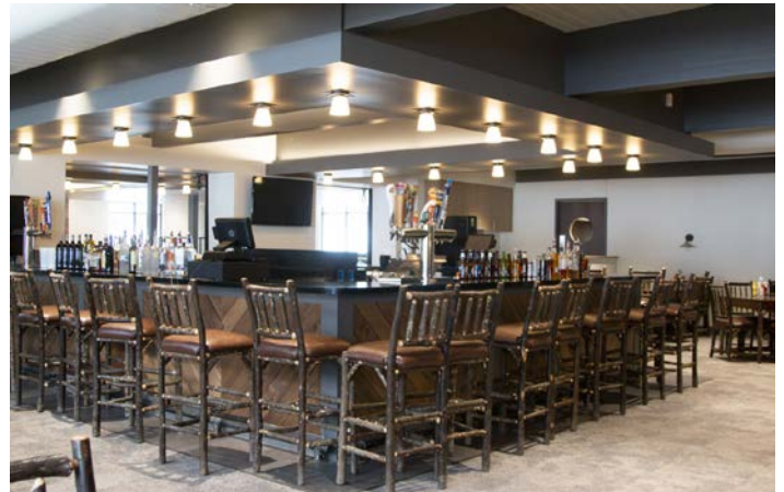
Bar area of The Tannery Banquet Hall