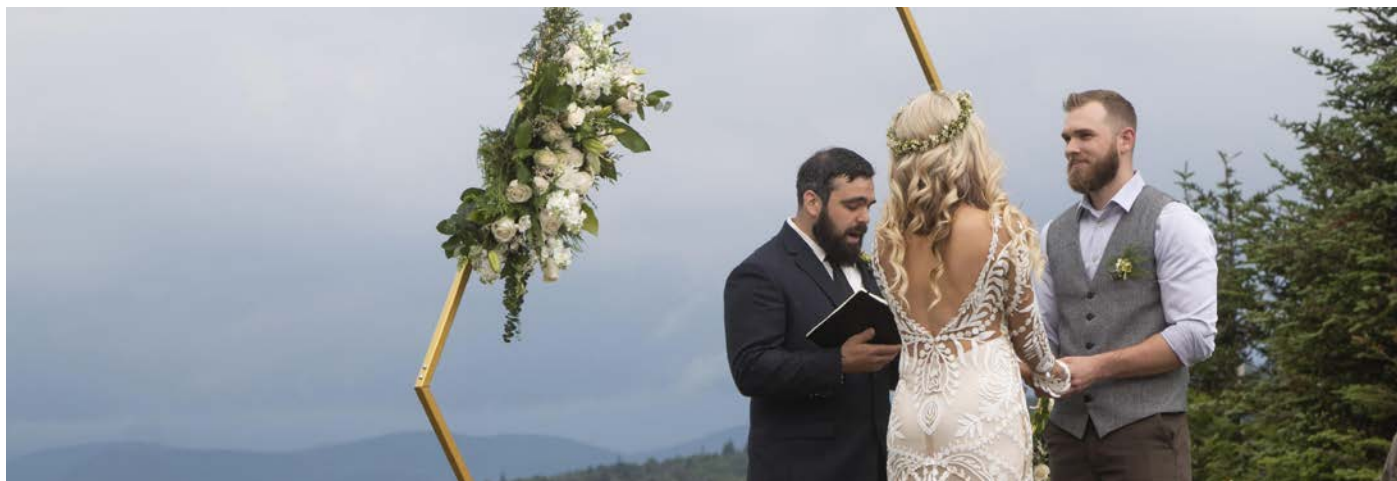
Couple Under the Golden Wedding Arch

Services not provided by the venue include but are not limited to: Linens, Day-Of Coordination, Entertainment, Florist/Decorator, Photographer/Videographer, and Officiant.