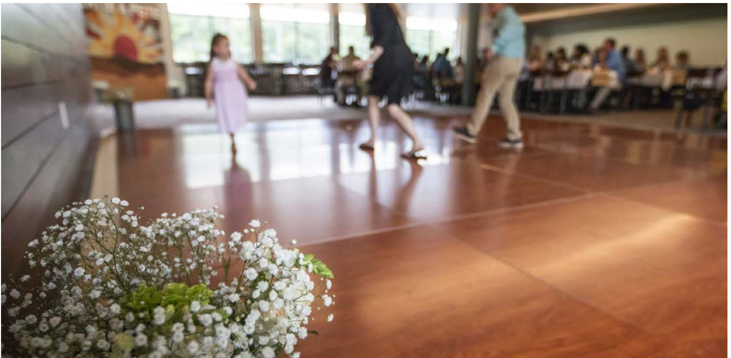
Indoor Dance Floor