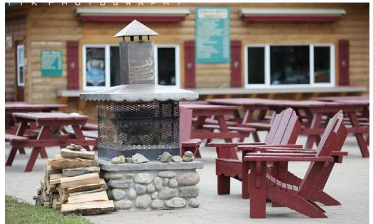
Chiminea on the Outdoor Patio