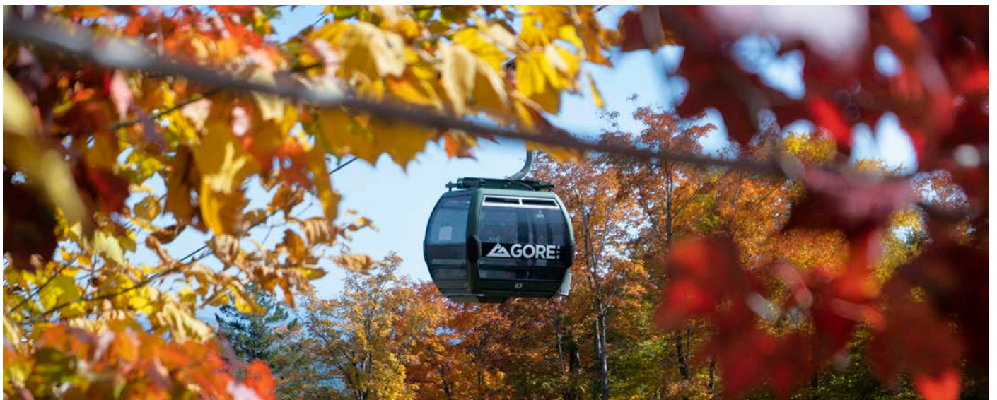
The Northwoods Gondola