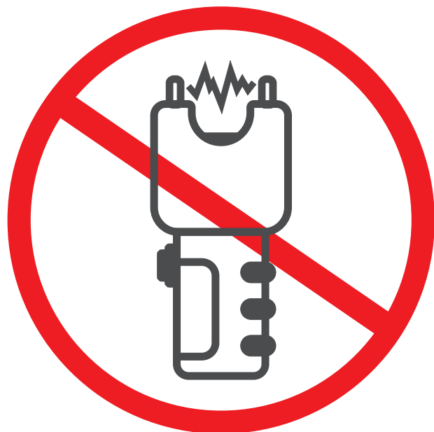
ELECTRONIC STUN GUNS