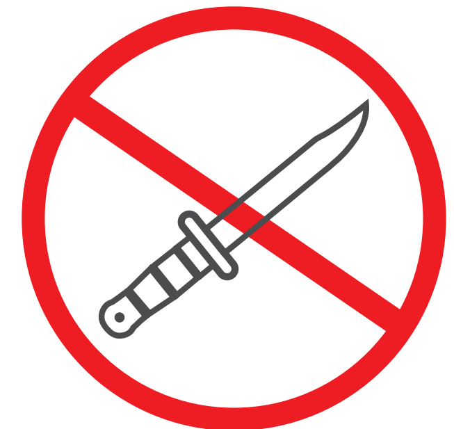
EDGED WEAPONS (Leatherman type multi-tool with blade of 3 inches or less allowed at Whiteface & Gore)