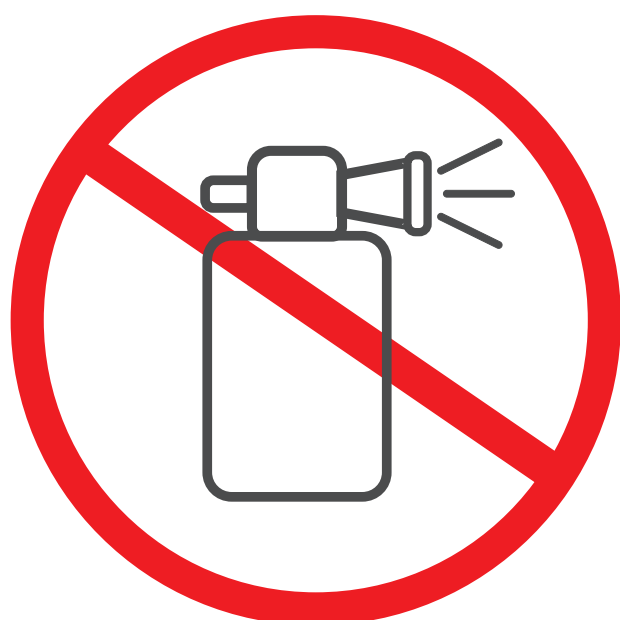
NUISANCE ITEMS & DEVICES