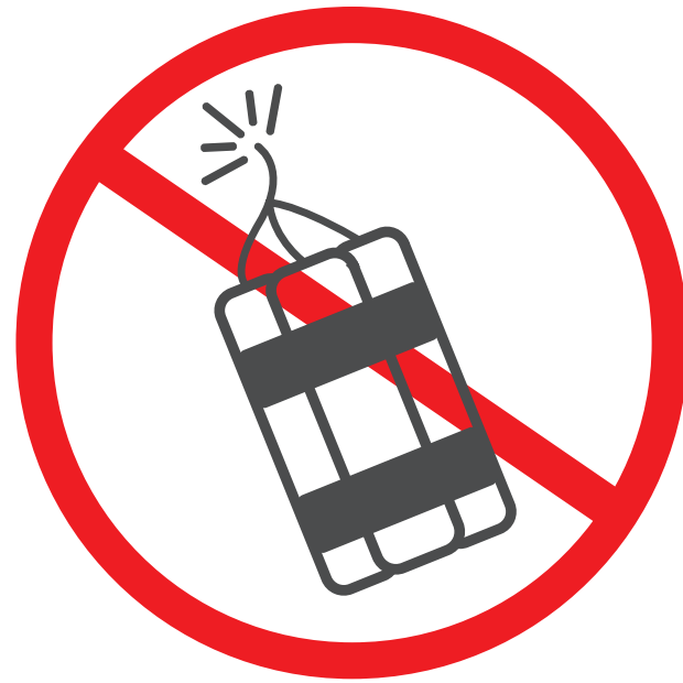
EXPLOSIVE AND/OR INCENDIARY DEVICES