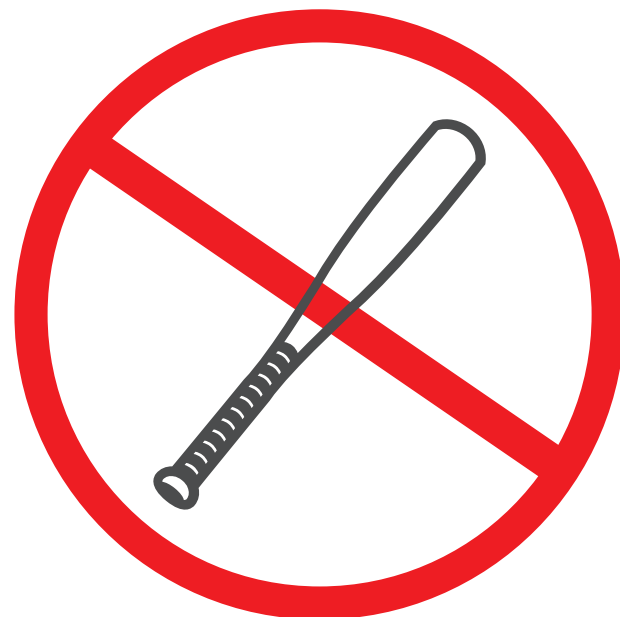
ASSAULT-TYPE ITEMS OR DEVICES